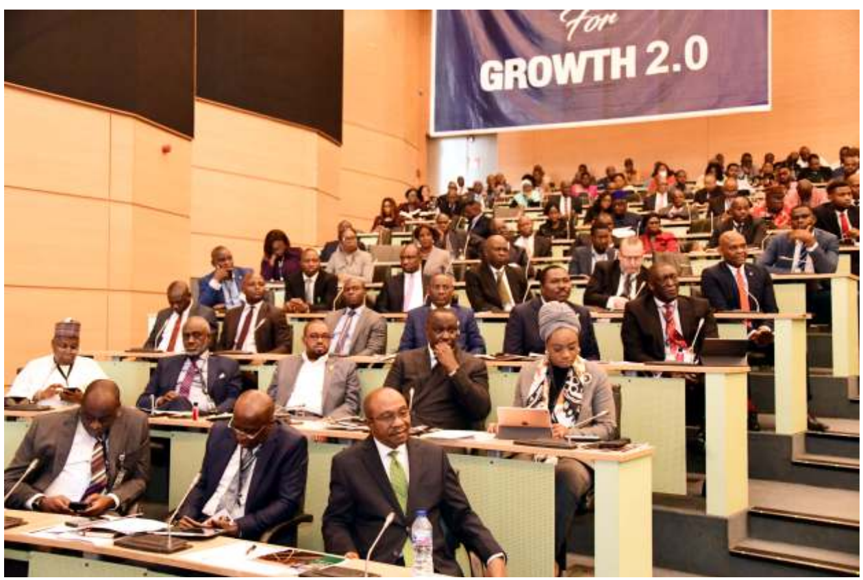
A cross section of participants at the Going for Growth 2.0 Consultative Roundtable at the Central Bank Head Office

ollowing the crash of stock markets around the world, which industry players termed "Black Monday", the Central Bank of Nigeria (CBN) in collaboration with THISDAY Media Group, organized a consultative roundtable with industry giants tagged: Going for Growth 2.0.